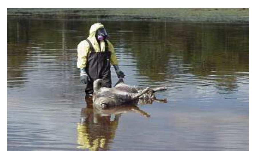
Contract clean-up worker with swine carcass, Hurricane Floyd aftermath, North Carolina, 1999

Problems encountered in the carcass disposal efforts (see Appendix C) included contamination of drinking water sources, fly control, odor control from excessive hydrogen sulfide (H<sub>2</sub>S), possible zoonotic (animal to human) disease introduction such as Leptospirosis, Salmonellosis, or Tetanus, and simple removal of the carcasses to nonflooded disposal sites (NCSUCE, 1999, p. 1-2, see Appendix C). Those problems were especially prevalent in areas of concentrated swine and poultry operations located on flood prone property, that may have previously been deemed unsuitable for other purposes.