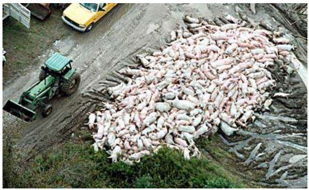
Swine carcasses prepared for burial, Hurricane Floyd aftermath, North Carolina, 1999.

inevitable. It quickly became evident that site selection and burial choice for animals drowned in the disaster elicited strong public opinion and emotions.