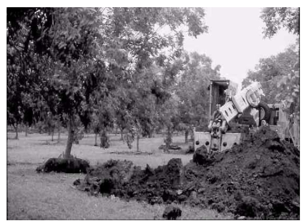
(Drowned cattle being buried in flooded orchard near Luling, Texas, Oct. '98)

Service, and the Texas Department of Transportation. Myriads of animal disaster issues were encountered such as identification and housing of stray livestock, capture and transportation of the same, as well as coordinating the disposal of the many large animal carcasses. Lower Colorado River Authority (LCRA - a pseudo-governmental agency) and local emergency response personnel played integral roles in coordinating the general debris removal and disposal process. Animal carcasses were generally considered as debris during the process, and were buried (where found if possible) or burned in air curtain incinerators along with other refuse. The laborious clean up process for animal carcasses took place over a two-week period in the 20 counties declared disaster areas (Wilson, TAHC internal report, 1998, & Ronsonette, 2001).